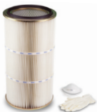
CI880- Filter cartridge for LT40/A (CI540) separator in polyester lavable - dimensions: 61 cm H x Ø27 cm

Spare parts Contains protection kit with mask and gloves